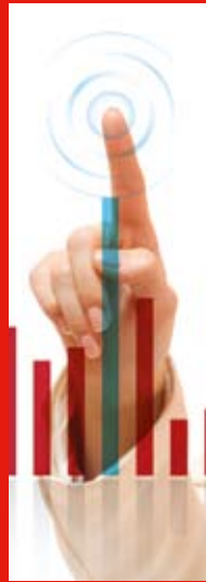
Shrink Management Software