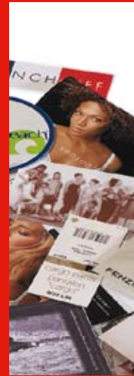
Apparel Labeling Solutions