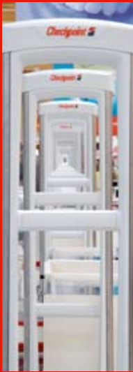
Electronic Article Surveillance

Checkpoint Systems is a global leader in shrink management, merchandise visibility and apparel labeling solutions. Checkpoint partners with retailers and their suppliers to reduce shrink, increase shelf availability, ensure labeling consistency and achieve operational excellence. Checkpoint's solutions enable retailers to enhance the shopping experience for consumers, and grow their businesses profitably.