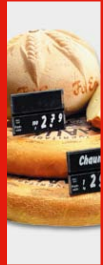
Retail Merchandising Solutions