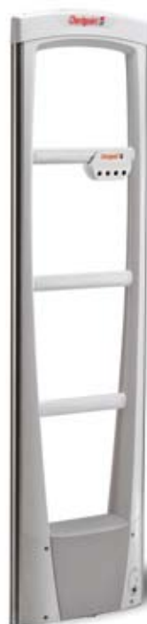
EVOLVE P10 antenna with integrated EVOLVE VisiPlus™ unit

The EVOLVE system, reflecting its name, is designed to evolve with a retailer's business. This highly extensible platform was engineered from its conception to provide a clear upgrade path to add new capabilities such as RFID, advanced networking, booster bag detection, and easy integration with other loss prevention systems.