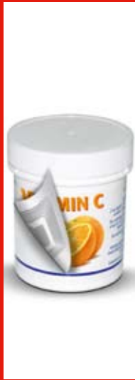
Labeling @ Source