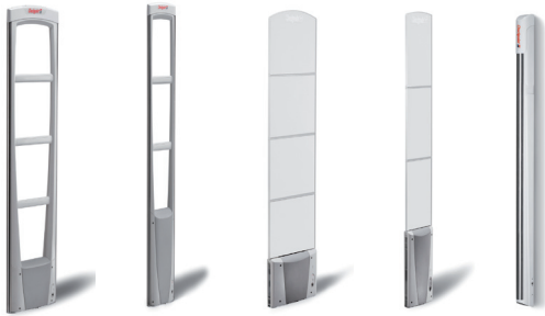
EVOLVE , the best-performing and most intelligent EAS platform available today

Checkpoint has a solution for virtually every need and supports both hand application in-store or source tagging applications at the point of manufacture.